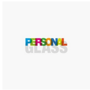
ACCESSORIES PERSONAL GLASS