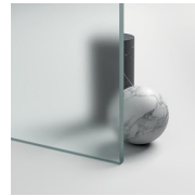
GLASS PANE 08 - SATIN GLASS