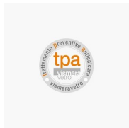
TREATMENT LIME SCALE TREATMENT PREVENTING LIMESCALE (TPA)