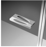
KNOB AND HANDLES M6T STANDARD