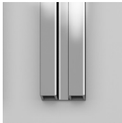
ANODISED PROFILES 21 - BRIGHT SILVER