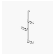
EQUIPPED COLUMN BASKET