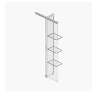
PARTITION PANEL SCREEN