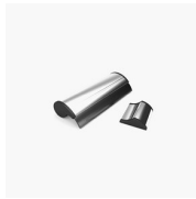
ACCESSORY FOR GLASS CLEANING VIRGOLA