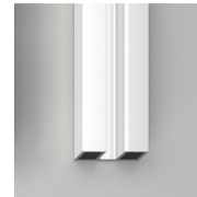
VARNISHED PROFILES 14 - WHITE