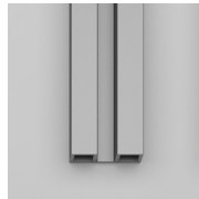
ANODISED PROFILES 31 - SATIN SILVER