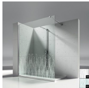
NATURAL DECORS P15 ORGANIC